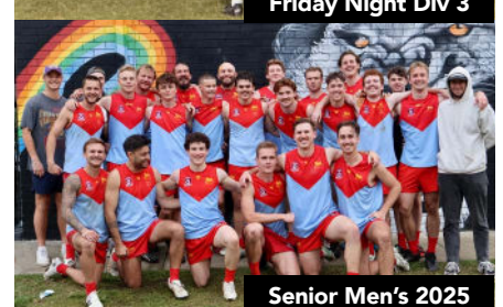
Senior Men's 2025