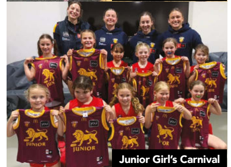
Junior Girl's Carnival