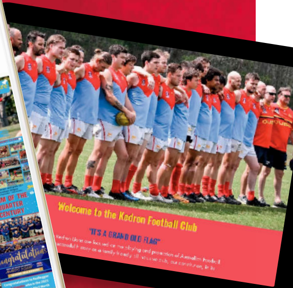
Welcome to the Kedron Football Club "IT'S A GRAND OLD FLAG"