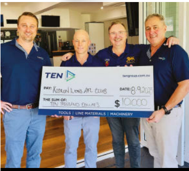
Thank you Ten Group & Scott Family