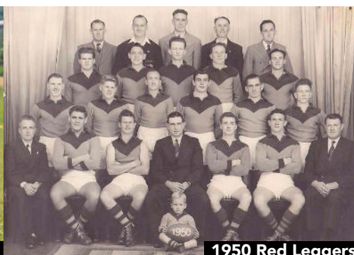
1950 Red Leggers