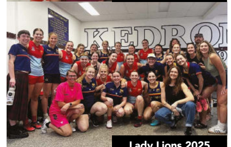
Lady Lions 2025