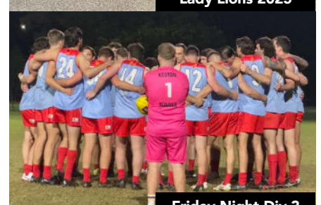
Friday Night Div 3