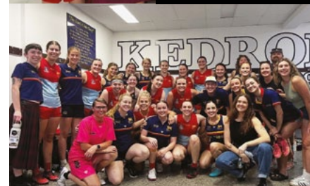
Lady Lions 2025