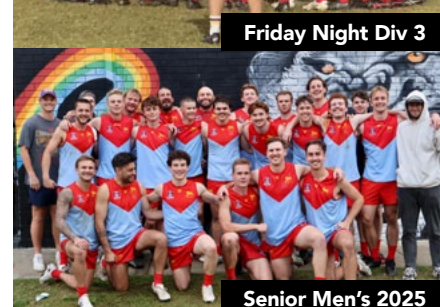
Senior Men's 2025