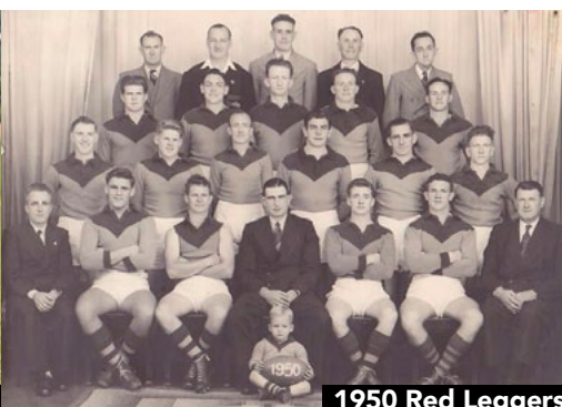
1950 Red Leggers