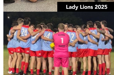
Friday Night Div 3