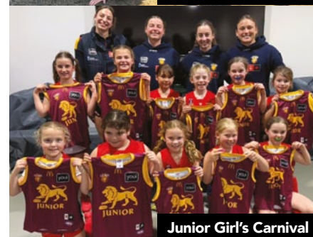
Junior Girl's Carnival