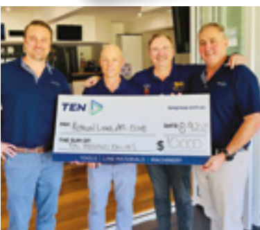
Thank you Ten Group & Scott Family