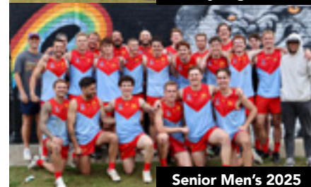
Senior Men's 2025