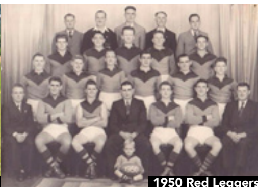
1950 Red Leggers