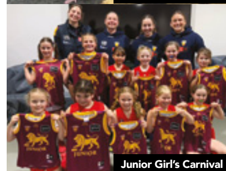
Junior Girl's Carnival